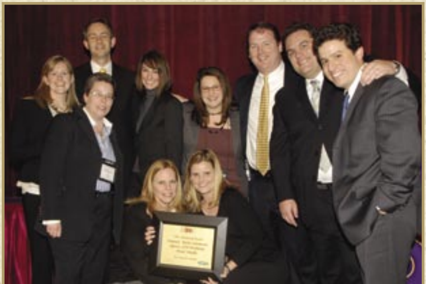
The Tamiflu marketing team at Roche, along with its agency partners, received the Big Idea chair from Yahoo! in recognition of the Gold Award for Best Integrated campaign.